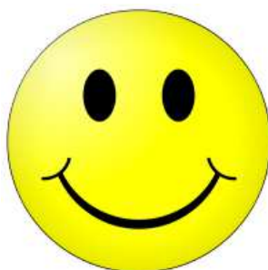
Figure 2.2. Pixel graphics can also be included, but in low resolution it looks terrible and in high resolution it takes ages to load.

Including pixel graphics like in Figure 2.2 is also possible. As mentioned before, pixel graphics have to be converted to the allowed formats beforehand.